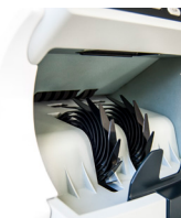
3 preset counting speeds.