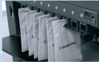
Replace bags without interruption.