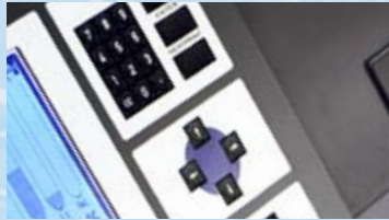
Simple push button operation.

There are eight bag holders and a reject tray. A light above each outlet indicates when a bag is full. An animated representation of the bags shows the level of coins in each one.