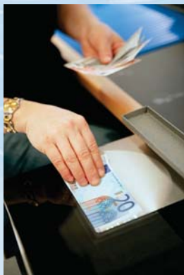
The Note unit can be installed to be used either by the cashier or the customer. Either way, it will never disturb client-cashier interaction.

World-leading sensor technology counts the coins and notes into the system, minimising the risk for counting errors and shrinkage. Recognising and rejecting counterfeit coins and notes is a vital function in a system that automatically recycles cash from one customer to the next. A store that accepts and passes on counterfeit cash, no matter how unwittingly, faces not only economic loss but also, and perhaps more damagingly, a sharp decline in customer confidence.