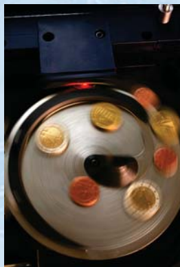
SCAN COIN's patented coin sensors guarantee accurate counting and sorting.

With its fine balance between capacity and size, CashComplete® POS is designed to fit existing counters, but has been sensitively designed for both current and future checkout styles. Every note and coin can be recycled and cashback becomes an option. CashComplete® POS allows smooth integration with existing EPOS applications.